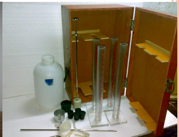
Product# 03-180 Sand Equivalent Apparatus