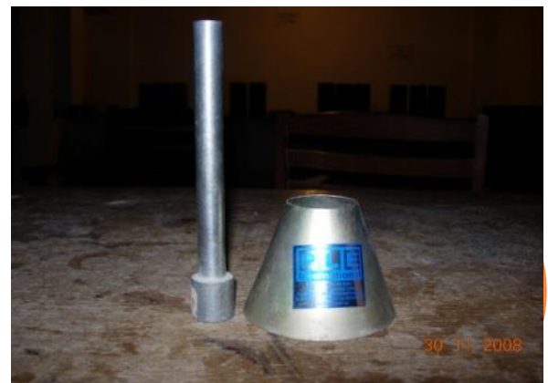
Product# 03-165 Sand Absorption Cone and Temper