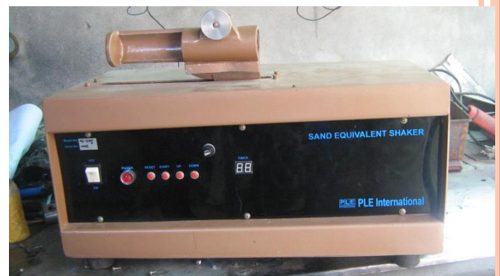
03-188 Sand Equivalent Shaker

03 - 188 Motorized Sand Equivalent shaker with interlock guard. EN Method. Weight 30.0 kg