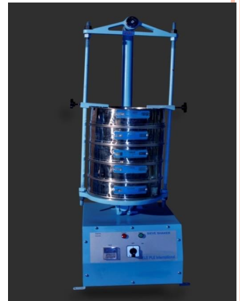
Product# 03-155 Mechanical Sieve Shaker