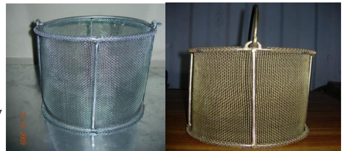
03-162 Wire Baskets (S.S) 03-163 Wire Baskets (Brass)