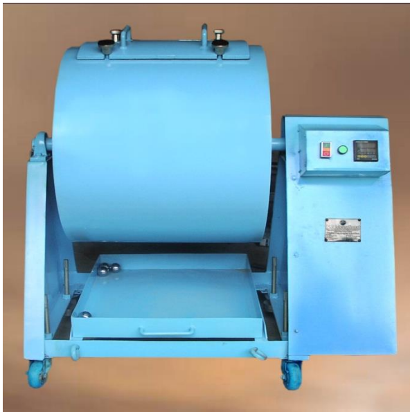
03-190 Digital Los Angeles Abrasion Machine

02 – 192 Digital Sound Proof Los Angeles Abrasion Machine