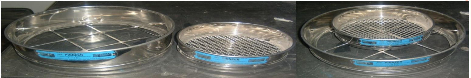
Stainless Steel Sieve Product# 03-135