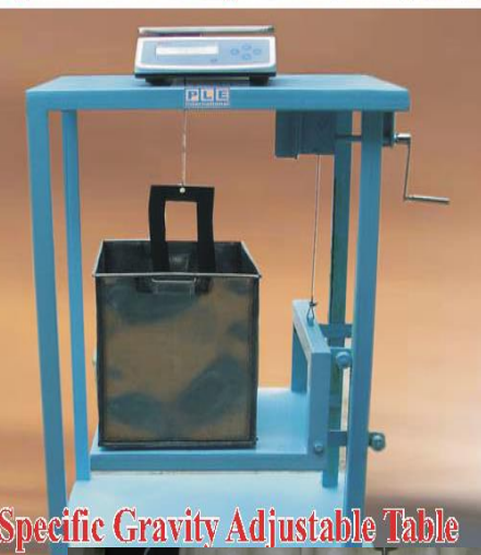
Specific Gravity Adjustable Table