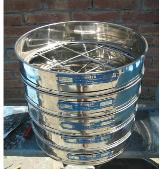
Stainless Steel Sieve Product# 03-110