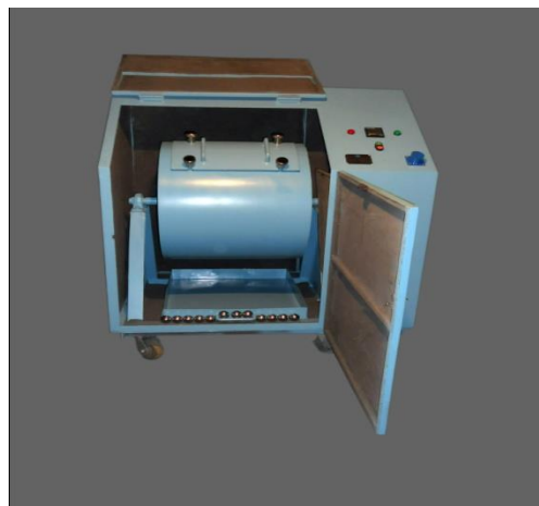
03-192 Digital Los Angeles Abrasion Machine Sound Proof (Inner Side)