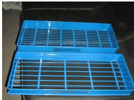
Product# 03-150 Flakiness Sieve

Sizes: 4.9 x 30mm, 7.2 x 40mm, 10.2 x 50, 14.4 x 60mm, 19.7 x 80mm, 26.3 x 90mm, 33.9 x 100mm