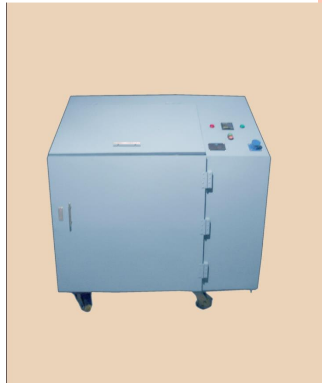
03-192 Digital Los Angeles Abrasion Machine Sound Proof