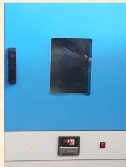
Product# 02-103 Digital Oven 150 Liters