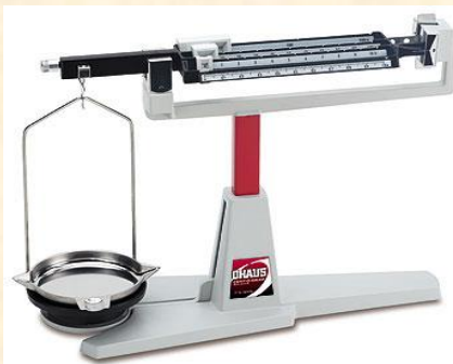
Product# 02-072 Cent-O-Gram Balance 311 x 0.01 gm