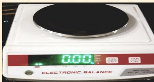
Product# 02-090 Electronic Balance (8 kg x 0.1 gm)