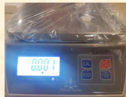
Product# 02-080 Electronic Balance (T-Scale) 30 kg x 1 gm