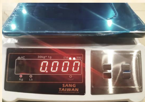
Product# 02-078 Electronic Balance (SANG) 30 kg x 1 gm