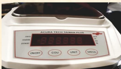
Product# 02-088 Electronic Balance (Acura Tech) 8 kg x 0.1 gm