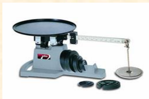
Product# 02-076 Single Beam Field Balance 16 kg x 5 gm