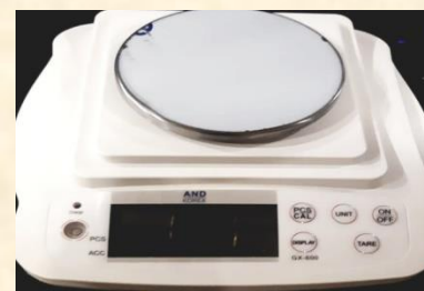
Product# 02-092 Electronic Balance AND 1000 gm x 0.01 gm